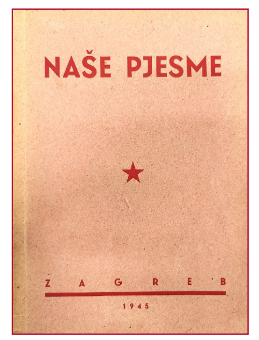
Figure 3. Second edition of the songbook Our Songs [Naše pjesme], published in the second half of 1945.