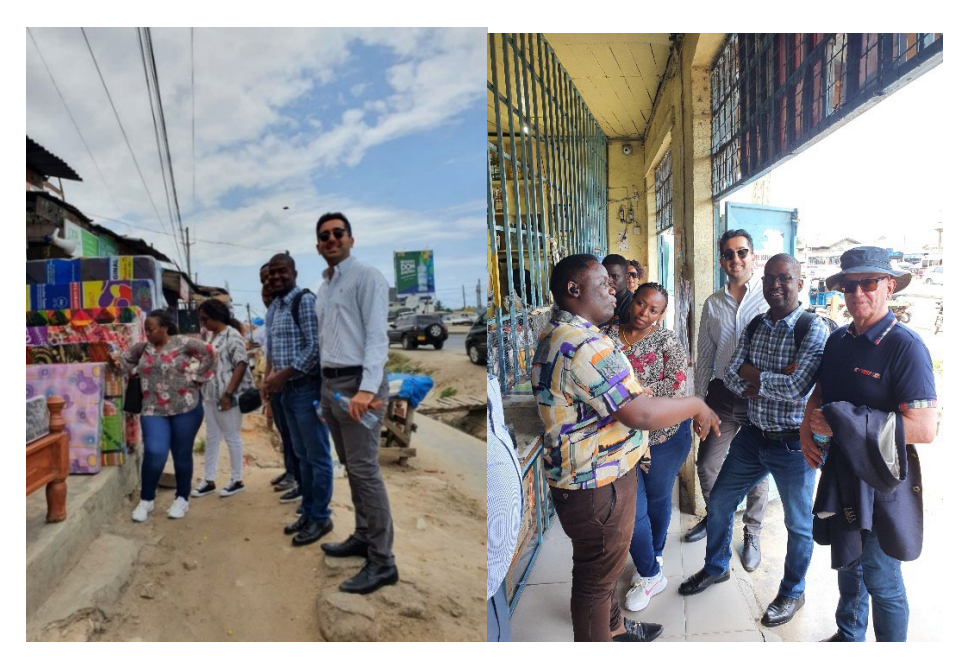
Field visit to Tegeta, Dar es Salaam; pilot site for the project "Tax compliance, VAT revenues and business development in Tanzania" (TaCoTa), 19 October 2021