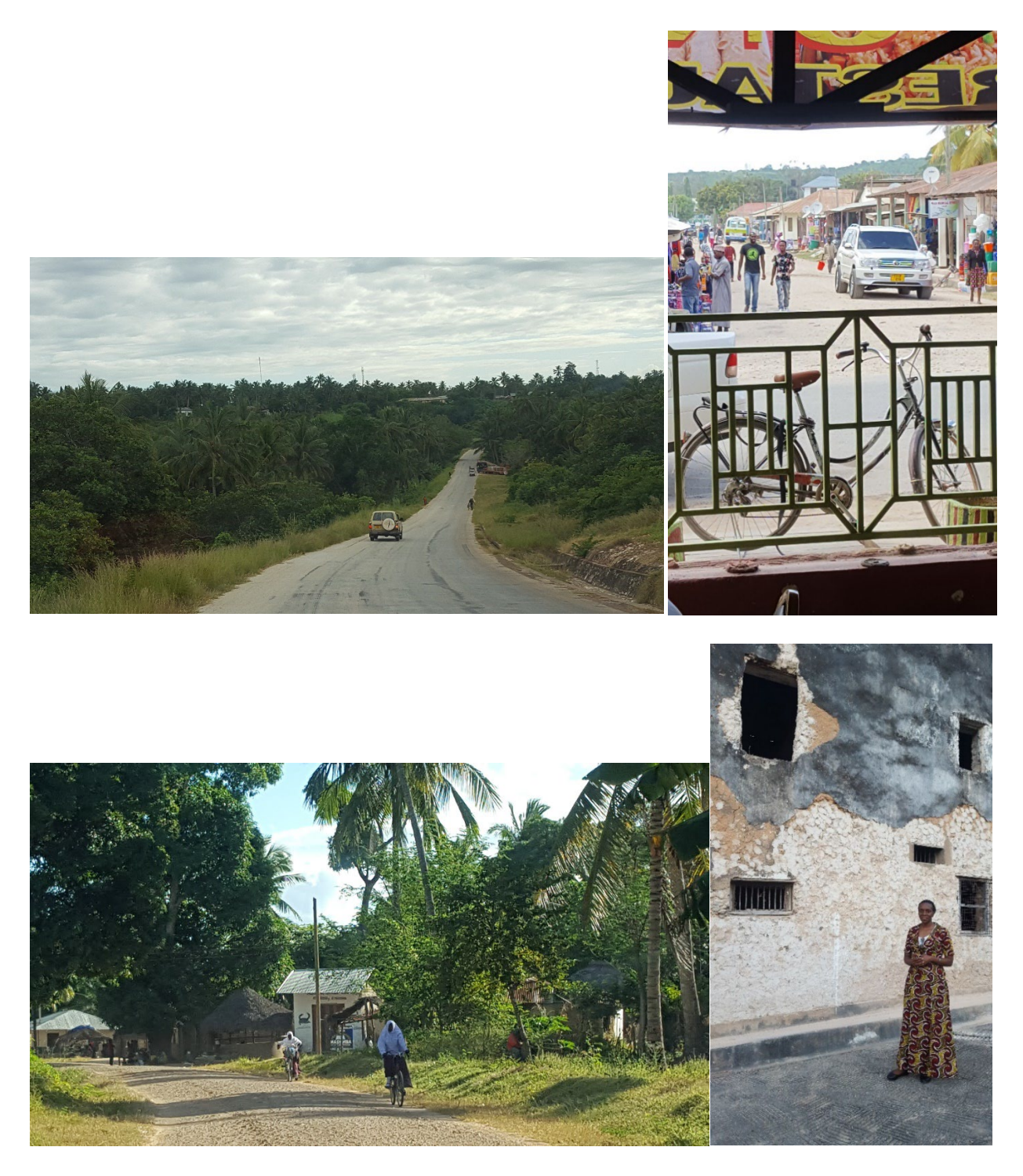
Fieldwork in Mtwara and Lindi, May 2016