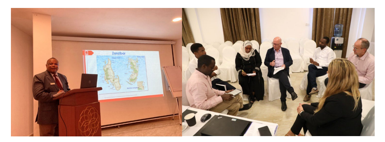
Tax workshop for the collaborative research and capacity development project "The role of trust and norms in tax compliance in Tanzania", Zanzibar, 6-7 Feb. 2023