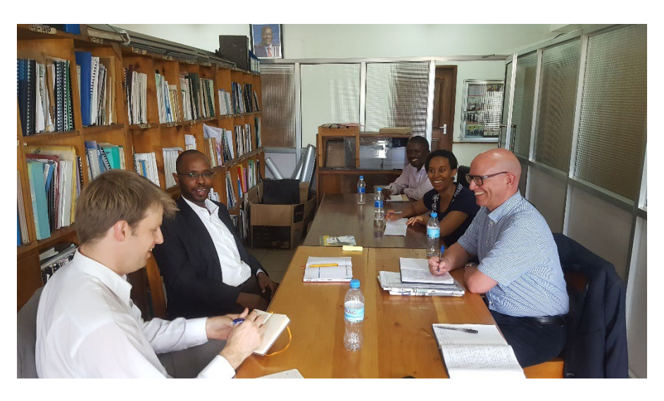
Meeting with the Association of Local Authorities of Tanzania (ALAT), 31 May 2016

This note provides an overview of projects and publications covering three decades of tax research in Tanzania. Our work on taxation and public finance management in other African countries, including Angola, Mozambique, Namibia, South Africa, Sudan, Uganda and Zambia, is not included in this note. We start with a brief presentation of the current tax research team at CMI.