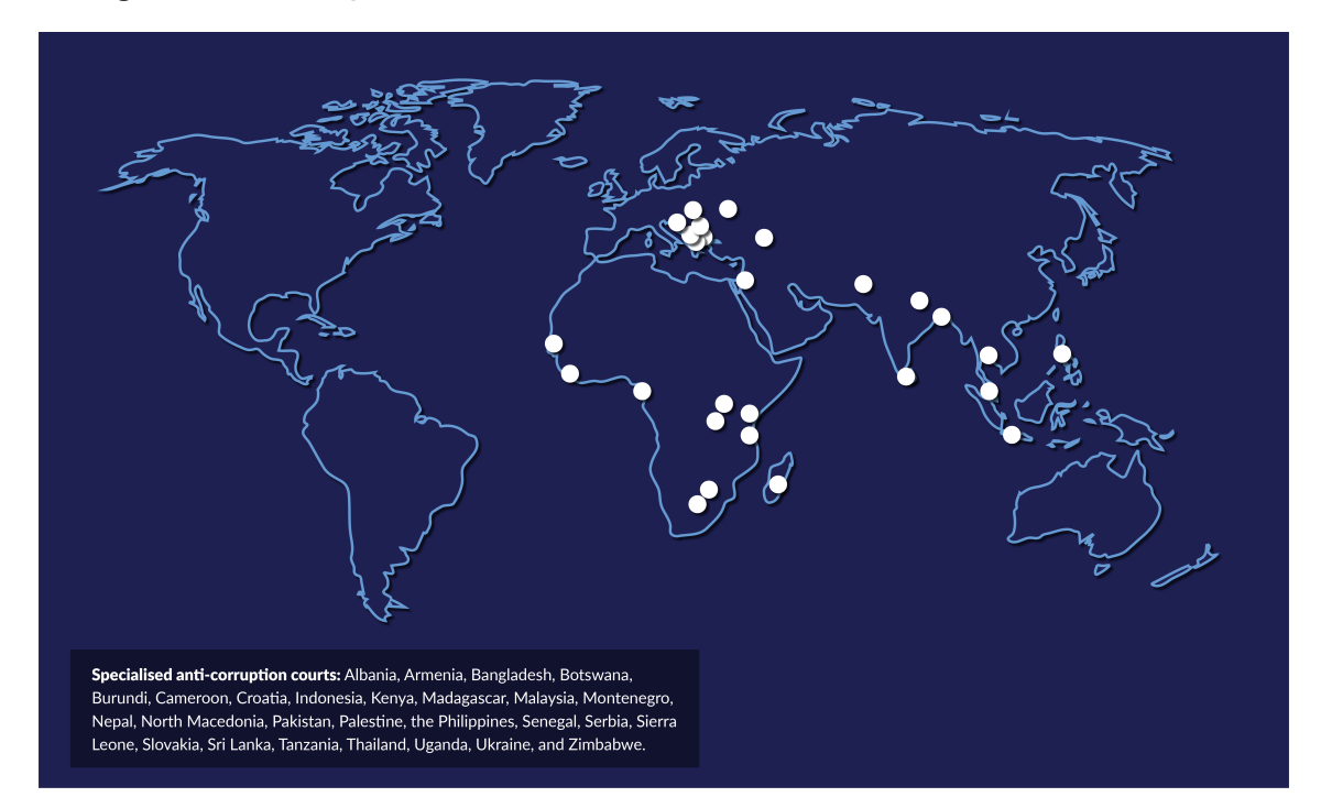
Figure 1. Anti-corruption courts in the world, 2022

Specialised anti-corruption courts: Albania, Armenia, Bangladesh, Botswana, Burundi, Cameroon, Croatia, Indonesia, Kenya, Madagascar, Malaysia, Montenegro, Nepal, North Macedonia, Pakistan, Palestine, the Philippines, Senegal, Serbia, Sierra Leone, Slovakia, Sri Lanka, Tanzania, Thailand, Uganda, Ukraine, and Zimbabwe.