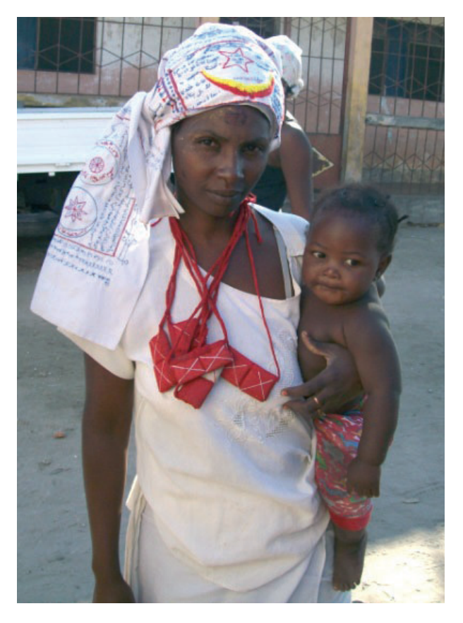
Fig. 3. Rewa (Lewa) spirit possession fundi, Mozambique Island.