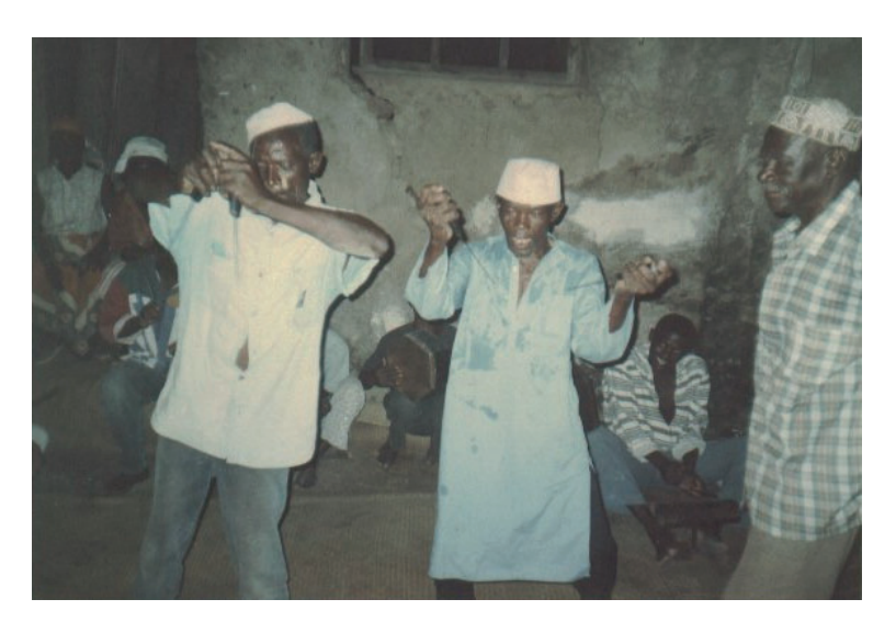
Fig. 11. A Rifa'i naquib performing a dhikr using dabushi with a murid. Mozambique Island.

As in the rest of the Swahili world, mawlid ritual has been 'the center' of Islam in northern Mozambique, because mawlid festivities and life-cycle ceremonies accompanied