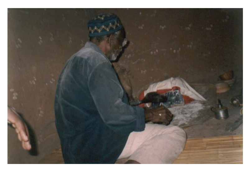
Fig. 8. A Muslim healer performing divination through contact with wa-jinni, Mozambique Island.