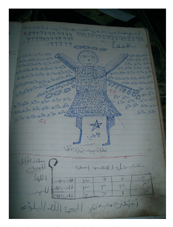
Fig. 4. A hand-copied book on jinni, Mozambique Island.

Indian Ocean. 13 In this context, Islam and the political influence of certain Swahili regions, such as Angoche, expanded significantly into the mainland. <sup>14</sup> Angoche's chances had increased considerably due to rising European abolitionist movement, the 1815 Vienna Treaty between Portugal and Great Britain, the 1836 Sá Bandeira Decree, followed by the Decree of 1842 prohibiting the exportation of slaves. 15 As a result, the ports of Mozambique Island and Quelimane, from where slaves were exported earlier, became difficult destinations for slave traders (negreiros in Portuguese). By 1847, many moradores (Portuguese settlers) of Mozambique Island had relocated their feitorias (Port., 'factories' or 'commercial establishments') to Angoche. 16 By the 1850s, Angoche's rulers decided to seize for themselves the opportunity of capturing and selling slaves. 17 Musa Mohammad Sahib Quanto (d. 1879) was instrumental in bringing the mainland under the aegis of Angoche. 18 After several military confrontations with the Angoche's major commercial rivals of the time, the Zambezi prazos (Port., landed estates) of Maganja da Costa, Angoche became an important destination for slave traders from the interior, attracting caravans led by the Yao and the Marave, descending from the territories surrounding Lake Niassa.<sup>19</sup>