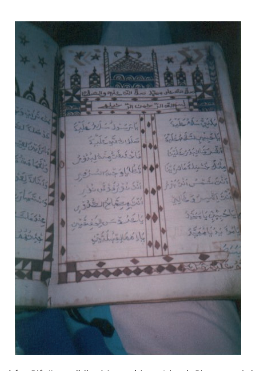
Fig. 10. Handwritten book used for Rifa'iyya dhikr, Mozambique Island.