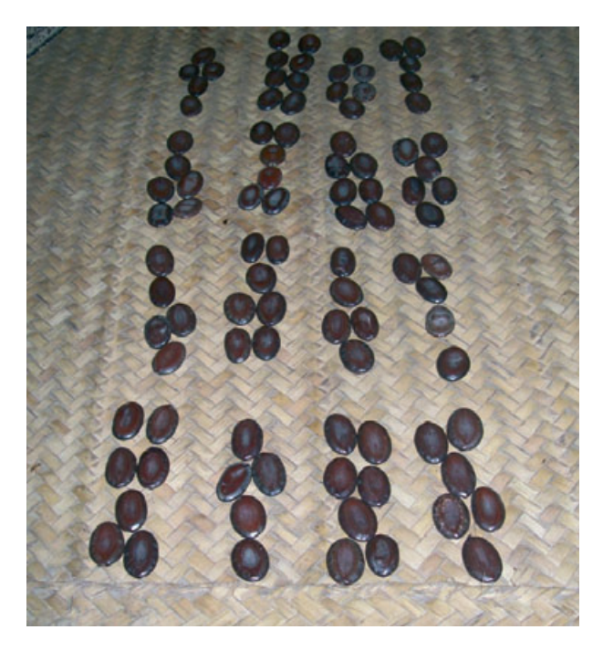
Fig. 5. Muslim divination practice, Ramuli (Khat al-Raml), Mozambique Island.