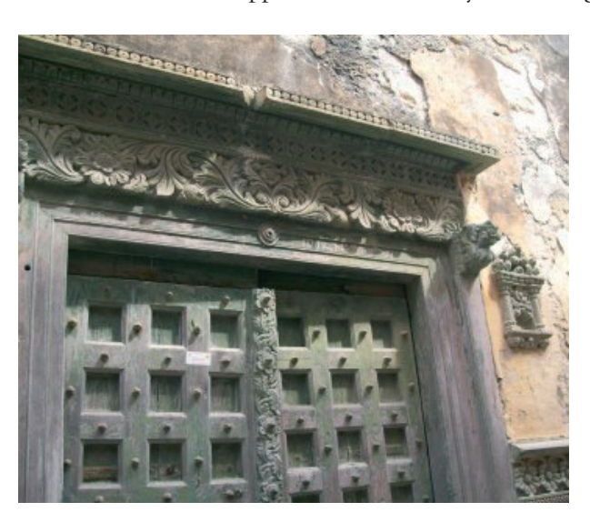
Fig. 1. 'Zanzibari' door, Mozambique Island.

During the eighteenth and nineteenth centuries, northern Mozambique and especially coastal Swahili became involved in the international trade in ivory and slaves due to their location near ports serving as outlets for slaves to be exported, and their roles as middlemen between mainland African slave suppliers and slave buyers coming from across the