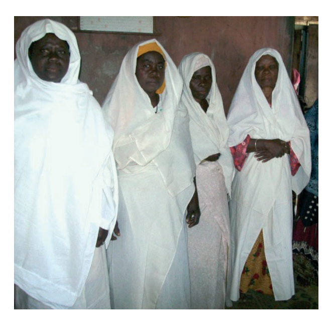
Fig. 2. Group of Maruhani spirit possession fundis (masters), Angoche.