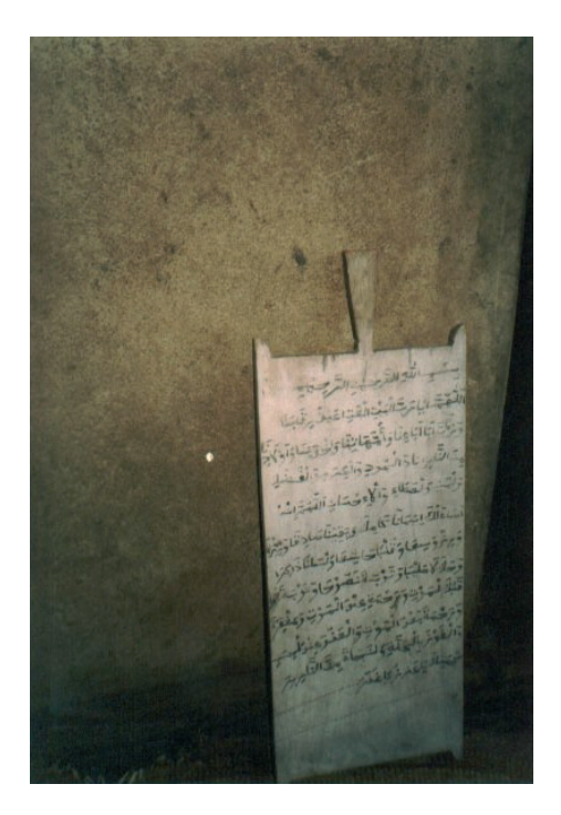
Fig. 9. Traditional wooden board in a Qur'anic school, Angoche.