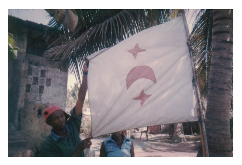
Fig. 7. A banner of a Muslim healer, Mozambique Island.

Islam in northern Mozambique was, as Randall L. Pouwels puts it for East African Coast, a 'walimu style of Islam'. 21 The power of the new ritual experts, such as the walimu (Sw., but in local vernacular) rested upon their Islamic religious knowledge, in particular of the kitabu (Ar., Sw., and in local vernacular 'the book', i.e. the Qur'an), as well as local traditional African knowledge of the spirit world of ancestors and, of the land and the sea (Figs 2–9).<sup>22</sup>