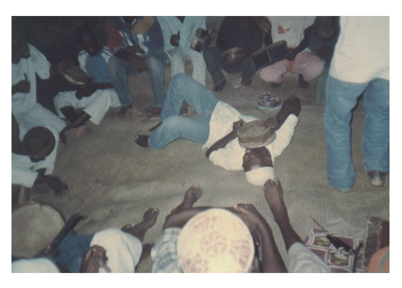
Fig. 12. Rifa'i dhikr, Mozambique Island.