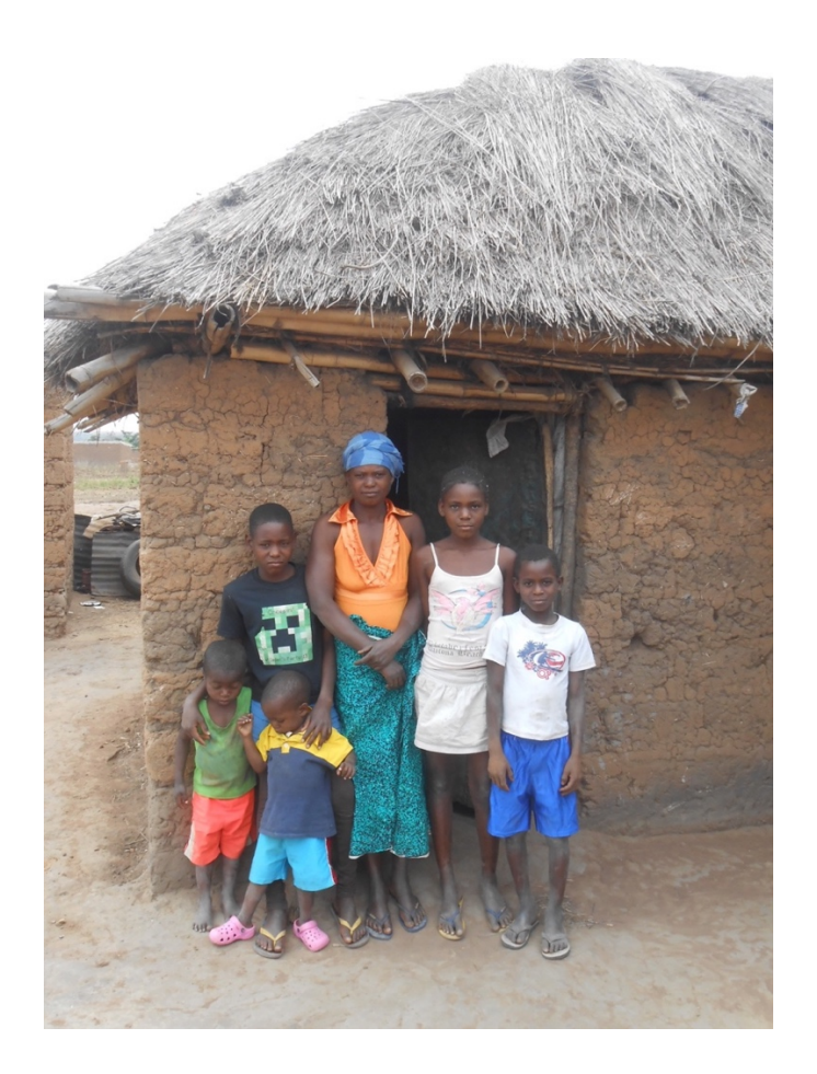
Woman with her children.