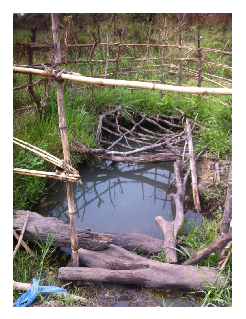
Untreated water source.