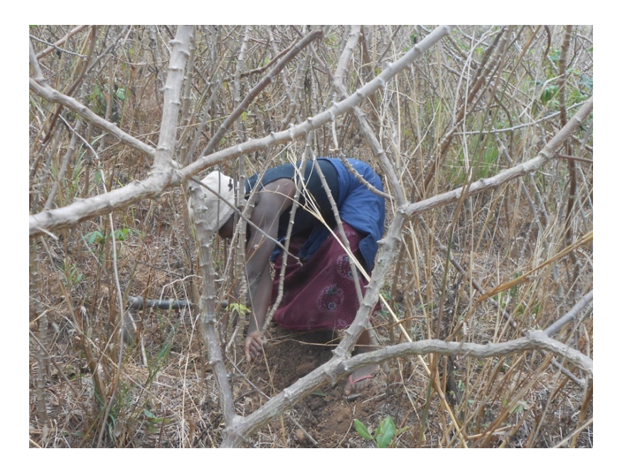
Female farmer working in her plot.

The fields used for cassava production is often located far away from the village. Indeed, it was not unusual that people have to walk for up to two hours to reach their plot. The main explication for this was that crops had to be located that far way in order to avoid pigs and goats to reach the field and destroy the crop. Animals had to be kept close to the village in order to avoid theft; an occurrence that according to our interlocutors have increased during the past years. Also, we were told that their current lands are located where their villages used to be, before villagers were moved closer to the main roads during the last years of the war.