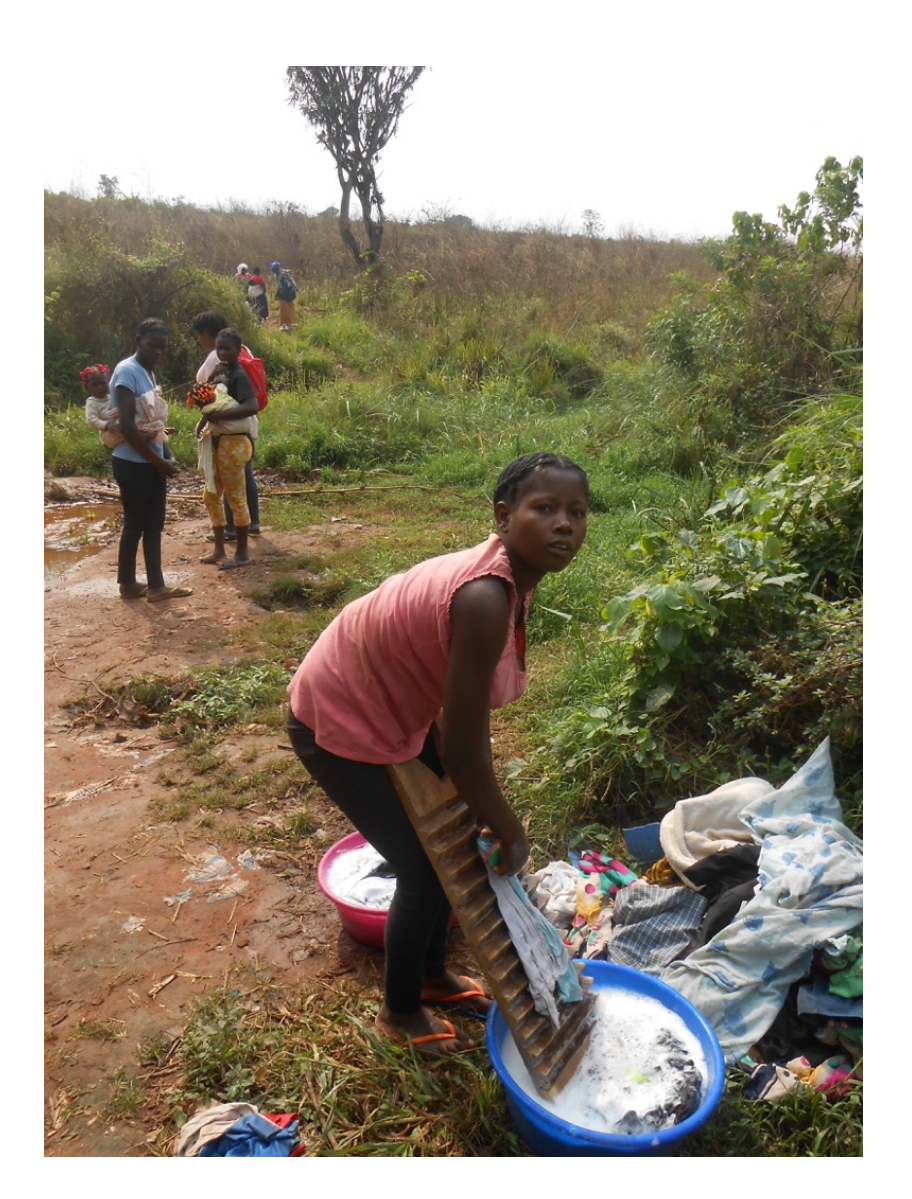
Young woman washing clothes.

The gendered division of labor was also reflected in the survey. 63 percent of male heads of household stated that it was the wife's responsibility to clean the house ( limpar ), 67 percent that it was her responsibility to sweep the house and yard, 74 percent that it was her responsibility to cook and 63 percent that it was her responsibility to fetch water. Moreover, 55 percent responded that it was her responsibility to buy food- and household items, and 60 percent that it was her responsibility to wash dishes. The remaining respondents answered that these households' chores were the responsibility of the women in the house in general, whilst a small minority answered that it was the couple's joint responsibility or the responsibility of the husband. Sweeping the floor and going shopping was the activity most commonly attributed to the malehead of household, with 9.5 percent and 17 percent respectively answering that it was his responsibility.