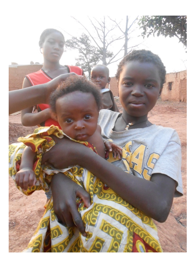
Young girl with her baby sister.

With few exceptions<sup>16</sup>, our female interlocutors reported that the practice of polygamy was a source for quarrels and insecurity. In one of the villages close the Kalandula sede, a heated discussion erupted about the audacity of husbands who came home from having entertained his girlfriend (with money that normatively should enter into the household), and then demanded that his wife made food for him. We then asked if the wife could refuse cooking for him in these circumstances. They responded that she could not and that she might risk a beating if she tried Thus, the wife's obligation to provide her husband with food carries strong customary and cultural connotation, no matter the circumstances. Neither does she have the right to "deny" him to have other wives or girlfriends. Within the household, it is expected that both spouses contribute if possible with money for medicine and school equipment, whilst the husband is expected to provide for larger items such as mattresses or plastic chairs/tables. However, as we could repeatedly observe, many household did not have these "luxury" items, particularly not the homes of single mothers or widows/widowers.