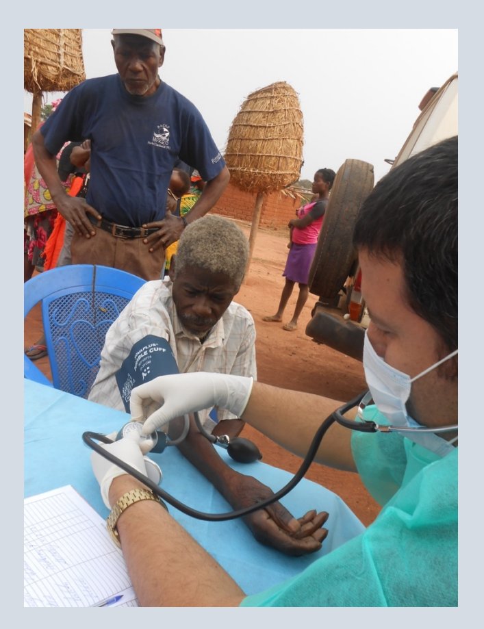
The doctor examining an elderly man.

One young woman had a serious untreated face burn, probably from an accident with open fire. The tissue in and around her eyes had healed in such a way that she was not able to blink or close her eyes. The doctor estimated that it had happened around three years ago. Her eyes were gravely infected- no wonder when she spent her days in the sun and dust in the field. She was in visible distress and seemingly traumatized and could barely articulate any answers to the doctor's questions. He gave her some pills and a cream to apply to the infected area, but there was not much more he could do. When we left in the afternoon, we tracked down the woman's hut in the outskirts of the village and gave her one of our sunglasses.