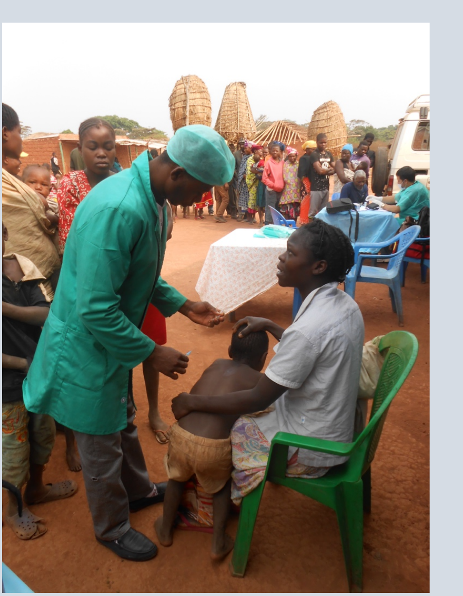
A child being vaccinated.

Some people were in a more critical state of health. One man aged 70 suffered from a cardiovascular condition and breathed heavily. One young woman with twins displayed clear symptoms of tuberculosis. Even more seriously, the assistant teacher in the village school also displayed symptoms of tuberculosis. This was evidently a major risk hazard for the children as tuberculosis is an airborne disease, and the potential for transmission inside a crowded hut is acute. The doctor insisted that those with sign of tuberculosis had to go to the Catholic hospital in Kalandula sede, which commonly took care of the tuberculosis-cases. However, he feared from experience that they would not go due to a lack of funds for the travel. The doctor did not tell people that they had tuberculosis. I was very stigmatizing because people got scared of disease transmission, he said.