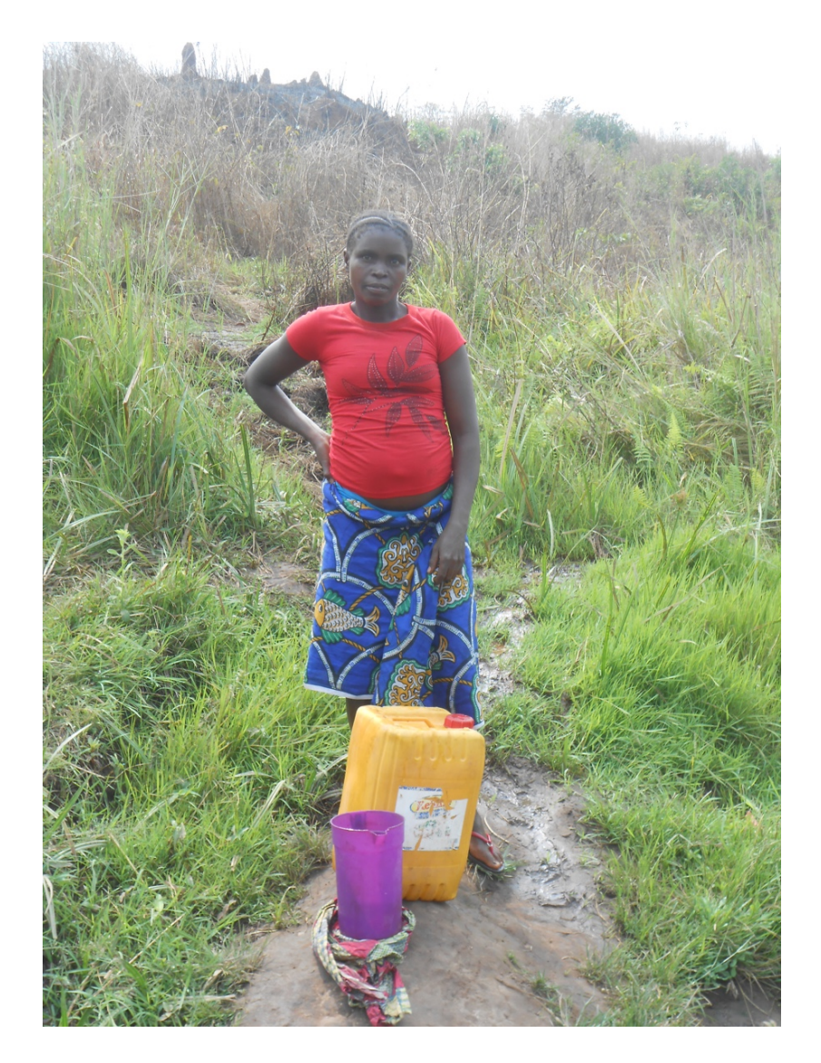
Woman fetching water.

The heaviest and most time-consuming task for women is to fetch water. In some villages, they may have to spend two hours to fetch water from the nearest usable water source. The women carry the water buckets on their heads, and both the women and the health personnel at the municipal clinic reported a high prevalence of muscular inflammation in the shoulders and chest, as well as back pain. Women's particular concern with water is also reflected in the household survey. 40 percent of FHH think that the lack of channeled water is the community's most severe problem whilst only 21 percent of the MHH answer the same. By far, the most common water source was the river, including for drinking water. The women complained that the water was often polluted, especially during the rainy season, and that it made their children sick. Only 4.3 percent of FHH had access to a water pump.