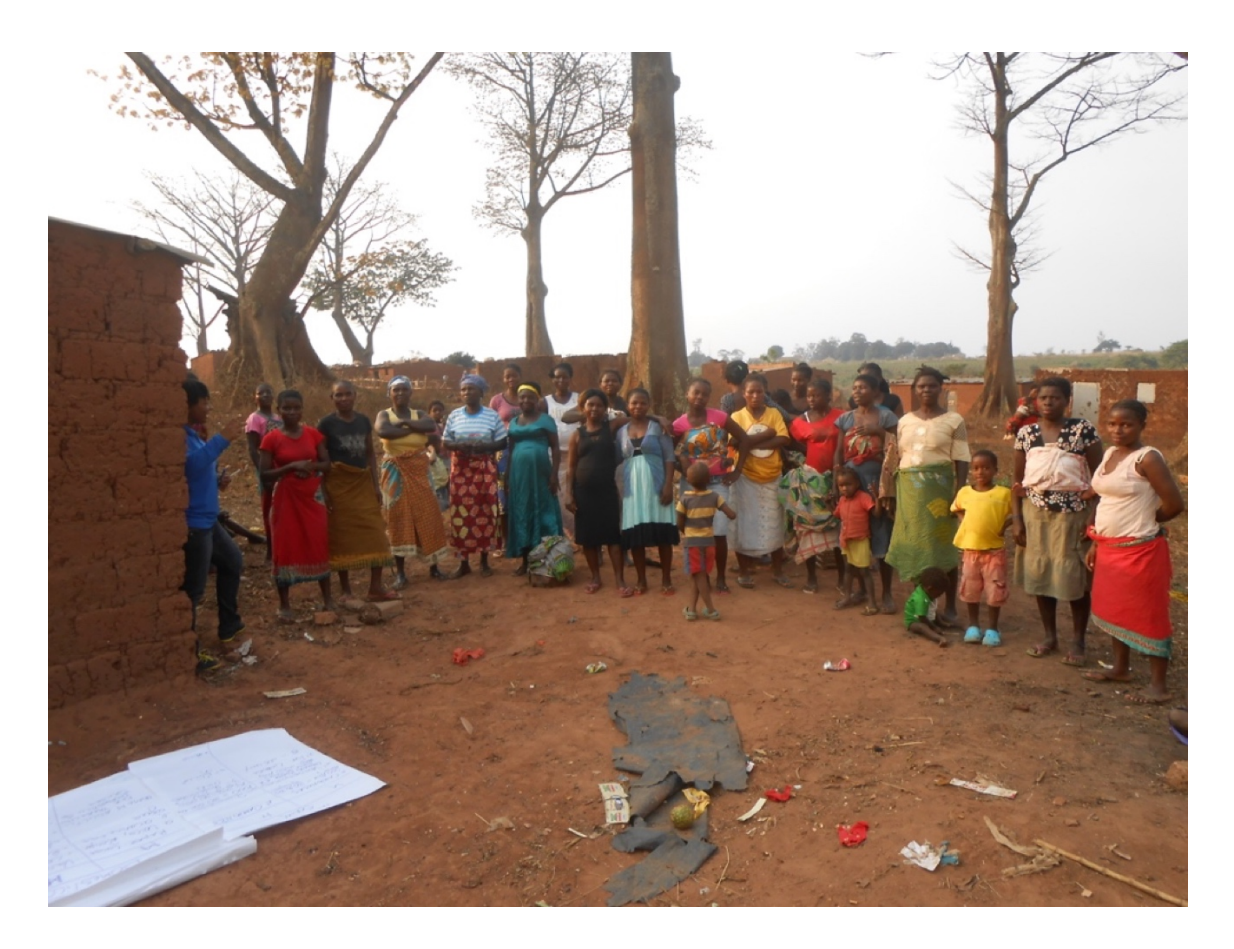
Focus group in progress.

Additionally, the report draws on existing surveys and reports developed by national and local authorities, private consultancies, international bodies, and others.