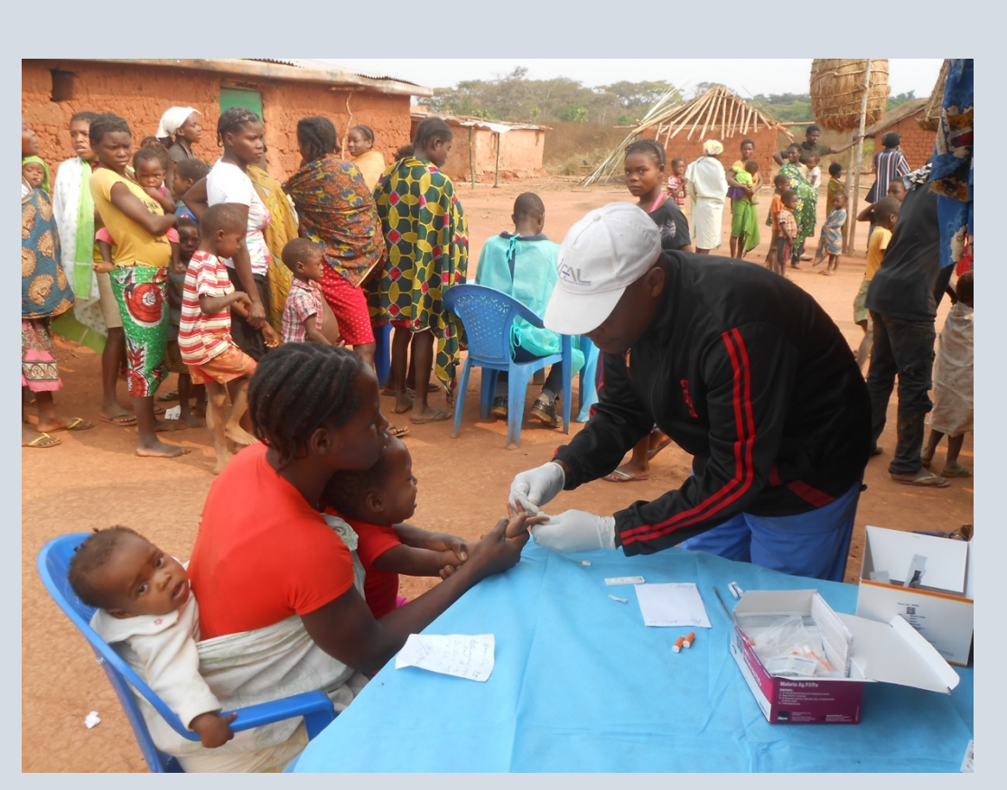
A mother malaria testing her child.

In the other queue, the Cuban doctor attended to patients with an ongoing medical condition. The line was long, and many of those waiting seemed to be in a very poor state. Many of them were old people, and not all of them could speak Portuguese. Many of them were illiterate and several did not know their age or which year they were born. The most common diseases identified during the consultations were respiratory illnesses and several cases of malaria. Many of the women complained of severe pains in the back, chest and neck, which was highly common because of their labor burden, the doctor said.