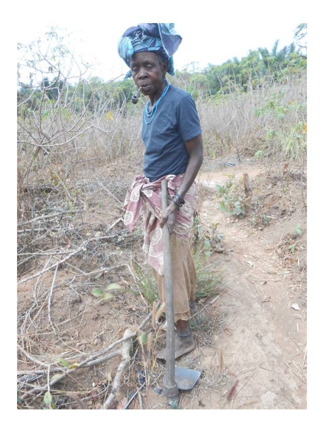
Elderly woman working her plot.

In addition to cassava, which virtually everyone cultivates in order to survive, some people also cultivate other crops on wetland along the riverside ( hortas ). This land is not subjected to the same collective property regime as land used for cassava production, and people reported that it is increasingly prone to be considered private property once cultivated. These crops included, amongst other produce, tomatoes, peanuts, sweet potatoes, beans and bananas.