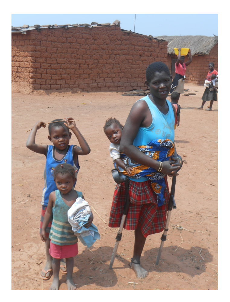
A woman with an amputated foot and her children.