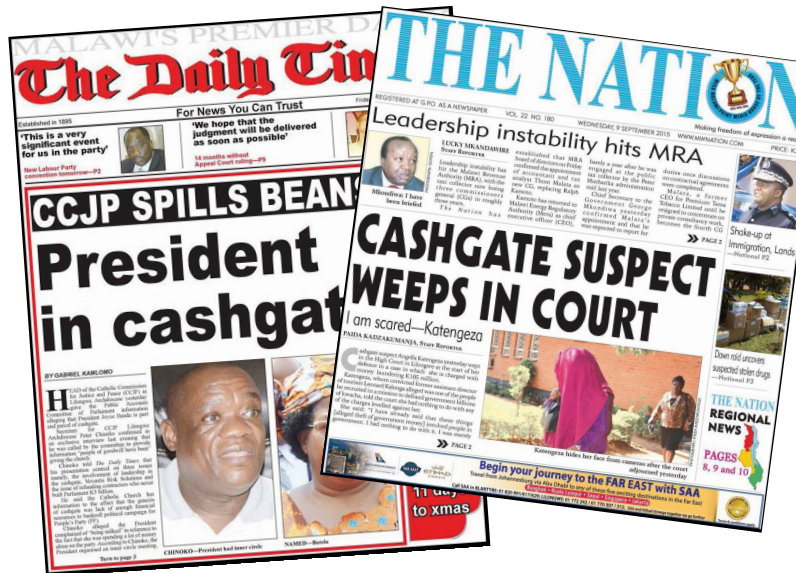
Media coverage of cashgate .

"What happened under the leadership of Joyce Banda made voters doubt women's capability. Broad day-light stealing of millions of kwacha made voters doubt women's capabilities in leadership positions like that of members of parliament."