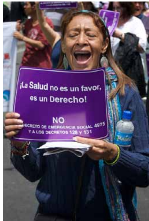
La Salud no es un favor, es un Derecho. Healthcare is a right, not a privilege.

The public and the associations of health professionals strongly opposed the emergency decrees issued by the government in late 2009/early 2010. One of the arguments against it was the intention to limit the access to health tutelas . In April 2010 the Court declared the decrees unconstitutional.