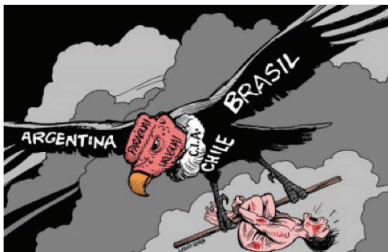
Operation Condor: US-Backed Conspiracy to “Kidnap, Disappear, Torture and Kill” Latin American Opponents of Dictatorships. http://bit.ly/1NxxAV

nationals from the Southern Cone countries plus Bolivia as part of the repression network called Operation Condor. 10 One of the latest reports from the Argentine prosecutions office details in all 2,166 people accused of crimes against humanity, of which about half are in detention, with around 13 percent having received sentences (Argentine Ministerio Público Fiscal 2015). The trials in Argentina are still ongoing.