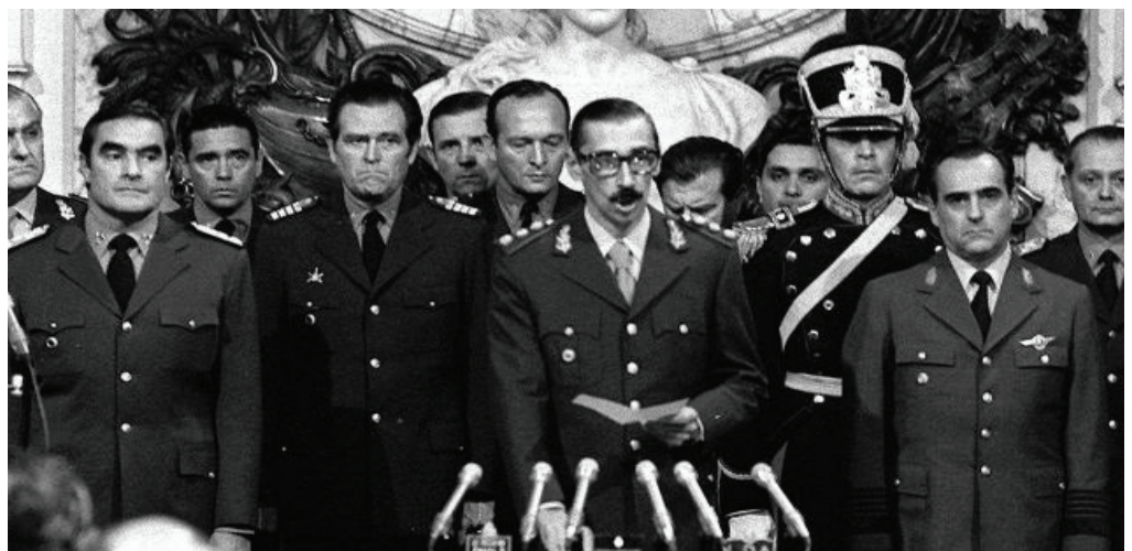
Former Argentine dictator Jorge Rafael Videla attends the last day of his trial in Cordoba, Argentina.

Senior researcher, Chr. Michelsen Institute (CMI).