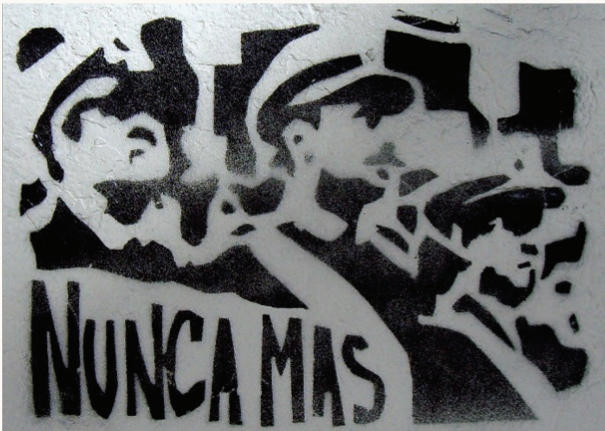
Buenos Aires graffiti of Videla and the Argentina dictatorship

These insights may be of assistance to Colombia, which is currently facing the challenge of staking out a policy of transitional justice in a context where full accountability and absolute impunity are equally unlikely. The insights from the Latin American experience with criminal justice for past wrongs could also be worth considering for countries elsewhere in the world (such as the post-spring Arab region) that are in the midst of transition from internal armed conflict to peace, or from military dictatorship to democracy, and have to make some tough political and legal choices regarding how to deal with their military. The aim must be “Never Again” human rights violations – Nunca Mas .