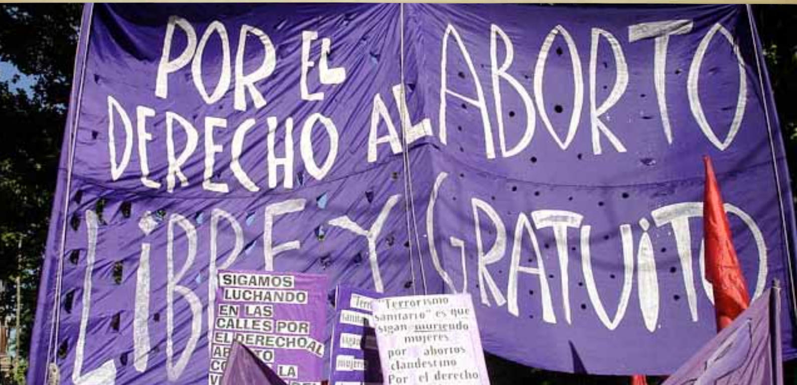
Is there a caption for this photo?

Millennium Development Goal number 5 (MDG 5) aims to reduce maternal mortality. In this brief we argue that, in the current global context more rigorous research focusing on the legal battles around women's sexual and reproductive rights – over who gets to control women's bodies – is of critical importance if this goal is to be reached.