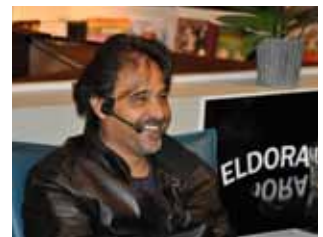
Angolan prize-winning author José Eduardo Agualusa talked about his literature at Eldorado book-store.