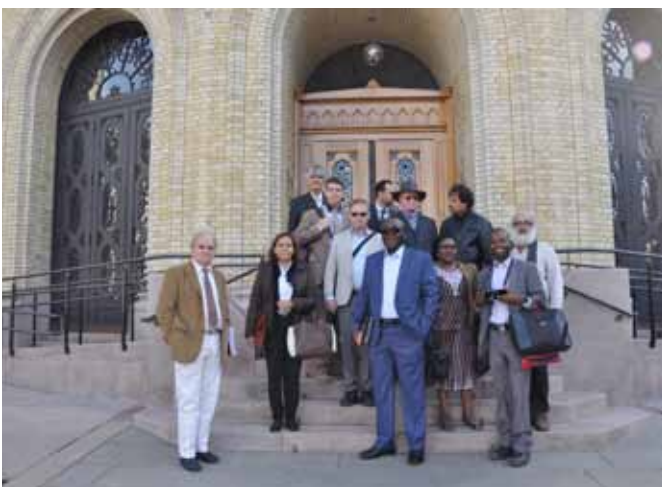
Some of the speakers at Løvebakken, before the meeting at the Norwegian Parliament, Stortinget.

Corruption is the last challenge of dos Santos's long political career. If dos Santos wins this challenge, the transition to new leadership will be smooth and stable. If he loses, the country will certainly suffer. If he cannot sort out this problem – one MPLA calls “produce more to distribute better” – whoever inherits the problem will face an even more hostile environment, one likely to lead to social unrest and unpredictable consequences.