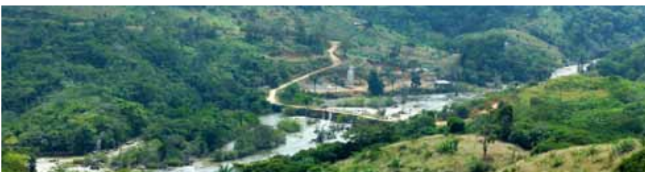
Angola has immense natural resources.