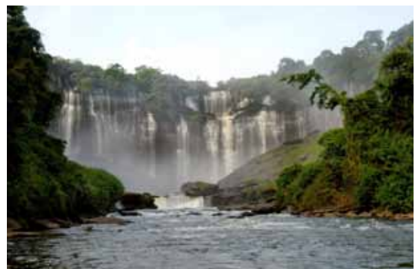
Angola's natural wonders: The Kalandula water-falls.