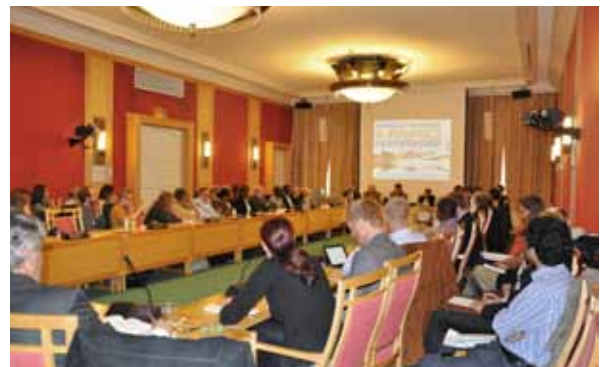
A seminar at the Norwegian Parliament, Stortinget, questioned Statoil and Norway's contributions in Angola.