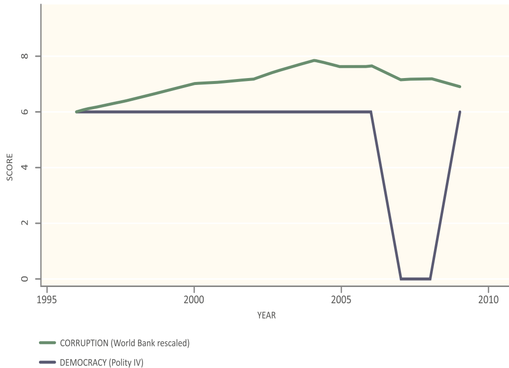
FIGURE 1. DEMOCRACY AND CORRUPTION IN BANGLADESH 1996-2009