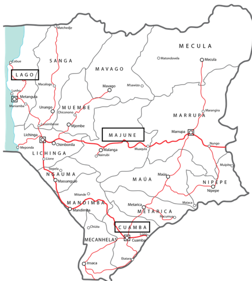
Map 2. Reality Checks Mozambique / Niassa Project Sites

Fieldwork for the 1 st Reality Check was carried out in September 2011. Sub-Reports from the Districts of Lago (Orgut 2011b), the District of Majune (Orgut 2011c) and the Municipality of Cuamba (Orgut 2011d) as well as the 1 st Annual Report synthesising the main findings from the Sub-Reports (Orgut 2011e) have all been published and are available at www.orgut.se . The 1 st Reality Check will serve as a 'baseline' for subsequent reports, and includes some more general background information and data about Niassa and the three project sites that is useful when reading the reports for the period 2012-2015.