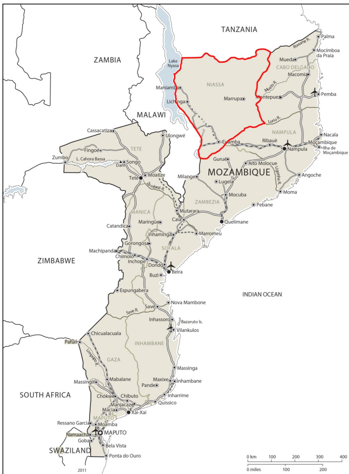
Map 1. Reality Checks Mozambique / Niassa