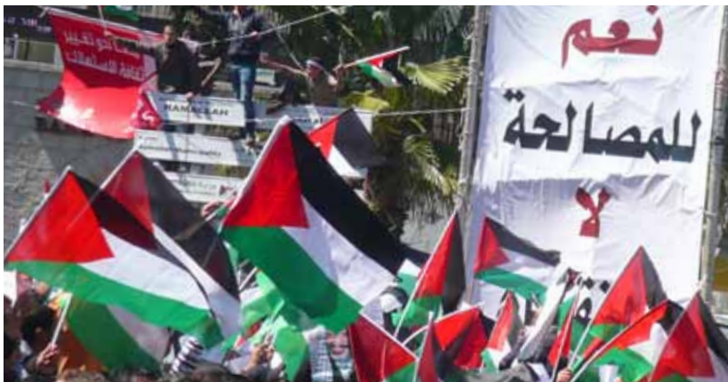
“Yes to reconciliation”

Soon after the 2007 split, efforts were made to reconcile the belligerents. Egypt, Saudi Arabia, Yemen – among others – all tried to negotiate between Hamas and Fatah. These efforts failed, however, and it was not until the Arab Spring that an agreement between the two was signed. The fall of Mubarak in Egypt – whose regime traditionally favored Fatah – and the turmoil in Syria – whose regime overtly supports Hamas – rebalanced the playing field and allowed the warring parties to negotiate with less external interference. Popular demonstrations calling for an end to the split also pushed the two to find common ground, and as Fatah already had lost their patron and Hamas was in danger of losing theirs, there were strong incentives to end the split to ensure their political survival.