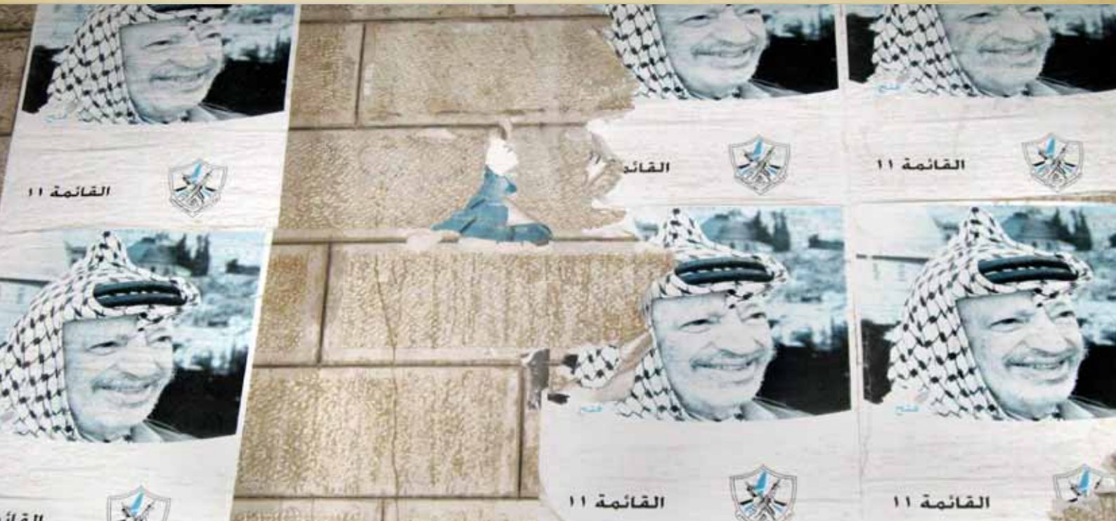
Yassir Arafat, Chairman of the PLO and President of the PA

This brief argues that even a successful reconciliation between Hamas and Fatah will fall short of providing the leadership the Palestinians need. Their domestic legitimacy are simply too frayed. Instead it argues that the hope for a united, legitimate Palestinian leadership rests on the creation of a new, non-factional and mass-based movement, independent of external patrons and free from international interference.