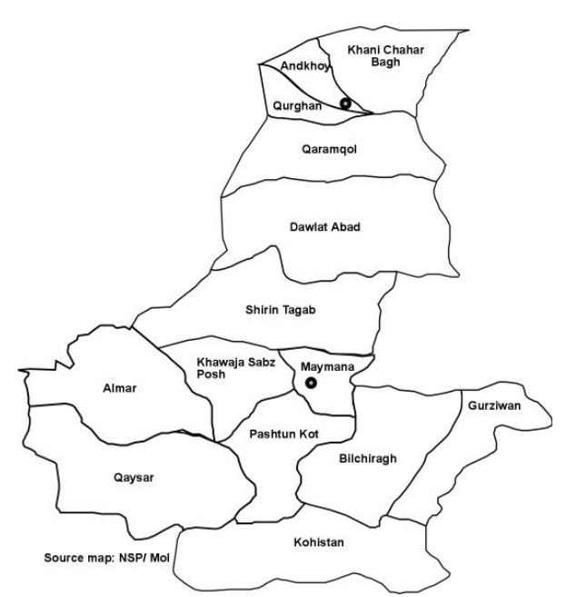
Figure 2 - Faryab Province with districts