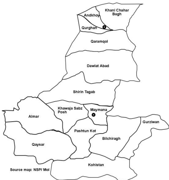
Figure 2 - Faryab Province with districts