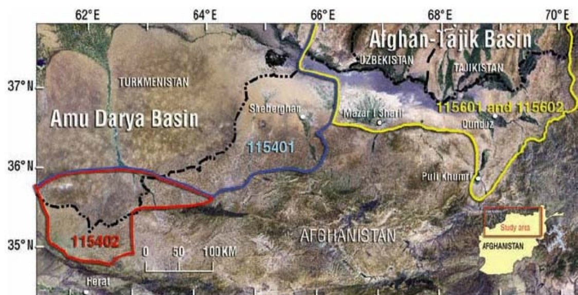
Map 1: Amu Darya and Afghan Tajik Basins

Following the preparation of the Afghanistan Power Sector Master Plan by Norconsult in October 2004, USAID initiated a feasibility study of a Sherbergan-based gas powered plant. Then, in April 2009, USAID funded the instalment of a drilling rig to test existing gas levels to determine if the wells contained enough gas to fuel such a power plant. 12 The Turkish company contracted for the testing did not, however, complete that task following a series of delays that, according to USAID, led them to terminate the contract. The Special Inspector General for Afghanistan Reconstruction provides a more nuanced picture on this termination (see below box), but does point out the potential importance of the project in securing Afghanistan's demand for low cost power. 13 The project risk referred to is expected to be an incident where General Dostum sent 200 armed men to protect the well. The team was not able to clarify why this incident took place, what the armed men intended to protect, why they then chose to withdraw, and following whose intervention.