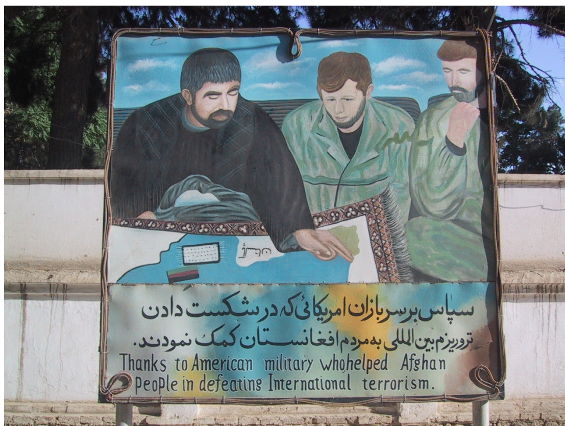
Poster outside the main entrance of the office of North Hydrocarbons in Sheberghan

But there have been a range of other internal conflicts over the last years that have contributed to an increase in ethnic tension in northern Afghanistan. Giustozzi describes the Faryab province as “the warlords’ hotbed” due to extreme levels of violence that took place in the 1980s and 1990s and continued competition between militant leaders in northern Afghanistan, that gradually turned from an armed struggle to a political competition. 19